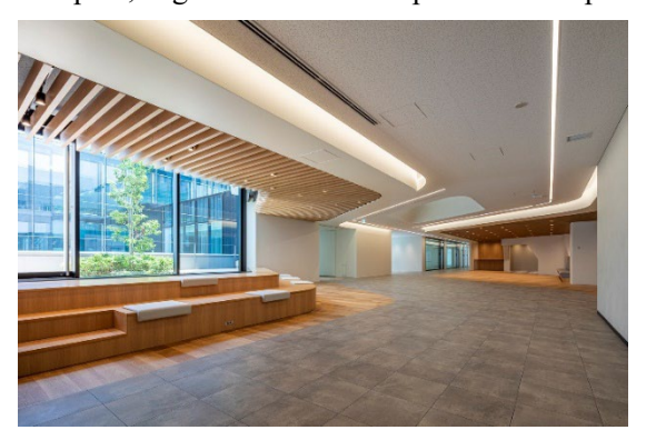
Left: Spine, Right: collaboration spaces in the Spine

A variety of design features were adopted in the construction of Chugai LSP Yokohama to induce innovation through communication of researchers from different fields and the fusion of their knowledge. The 300-meter corridor named "Spine" that connects laboratories and researchers' offices is the backbone of Chugai LSP Yokohama. By setting up spaces for meetings and collaboration in the Spine, where researchers will be walking around daily, this concept aims to stimulate conversations and lively discussions among these researchers. As a state-of-the-art research facility, Chugai LSP Yokohama exploits artificial intelligence (AI)-based drug discovery and automation incorporating robotics technology, in order to significantly improve the productivity and quality of research. Chugai hopes that the center's cutting-edge research and convenient location will attract excellent talents and enhance our relationship with external researchers both inside and outside Japan.